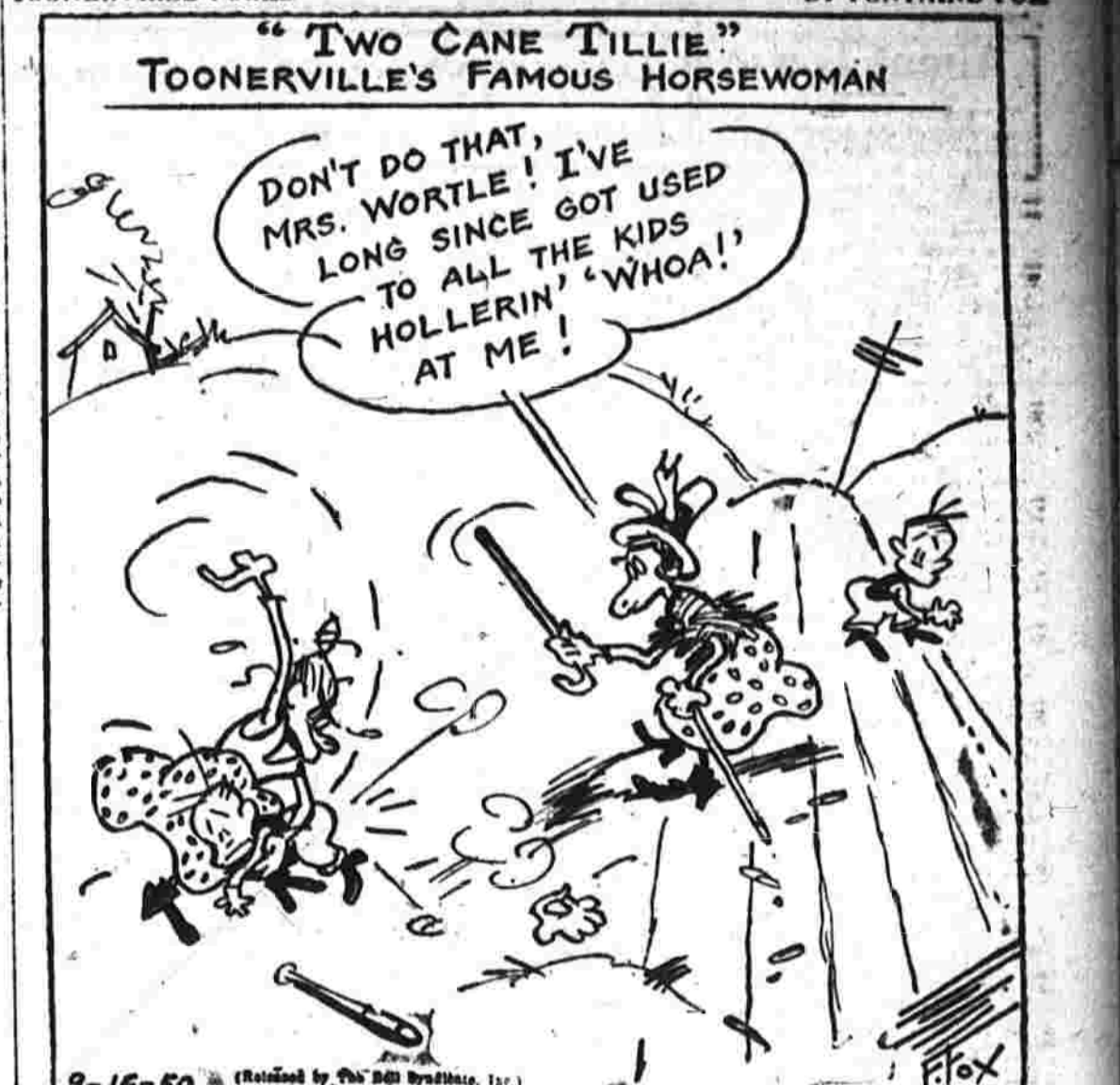
TOONERVILLE'S FAMOUS HORSEWOMAN BY FONTAINE FOX

Help Wanted—Male 38 FULL TIME stock clerk. Apply in person. Marlow's.