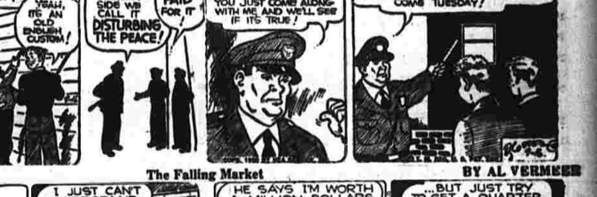
The Falling Market BY AL VERMEER