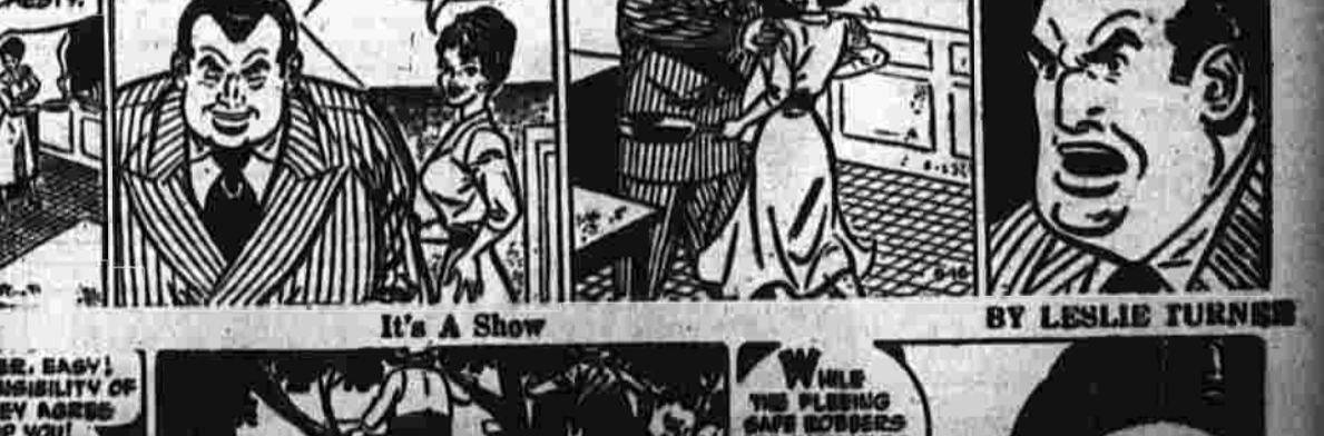
It's A Show BY LESLIE TURNER