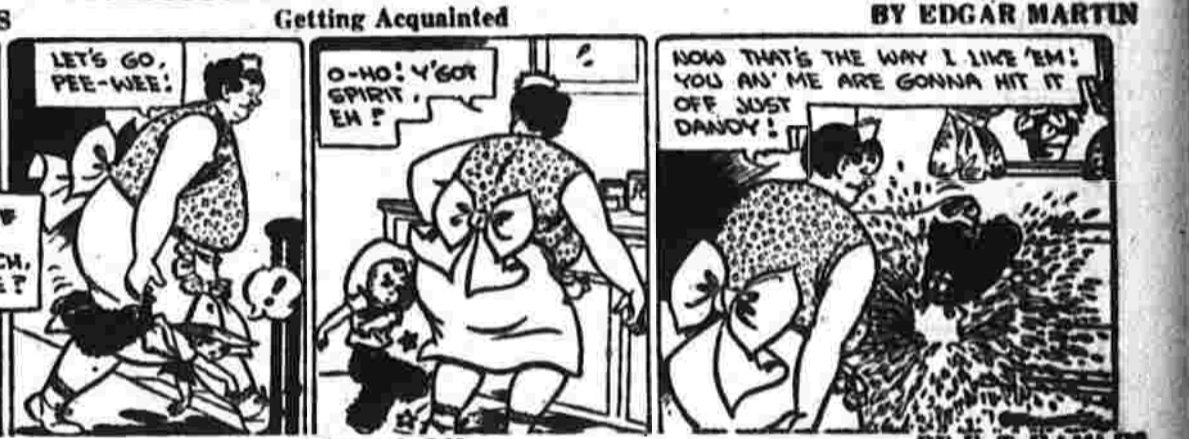
Getting Acquainted